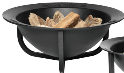
30 Gallon Fire Pit w/ Steel Tri-stand

© GOLDENS' CAST IRON • 600 12TH STREET, COLUMBUS, GA 31901 • 800.328.8379 • FAX: 706.596.2850 • GOLDENSCASTIRON.COM