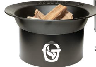
20 Gallon Gas-optional Fire Pit w/ High Profile Laser Stand