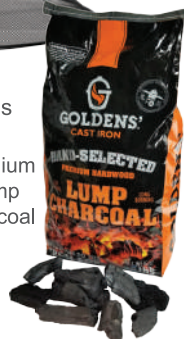
Premium Lump Charcoal