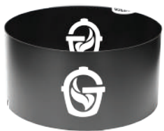
High & Low Profile Laser-Cut Steel Fire Pit Stand