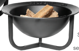
Stands sold separately