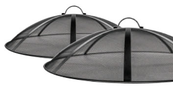
20 & 30 Gallon Fire Pit Spark Guards