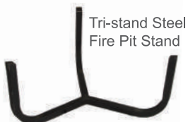
Tri-stand Steel Fire Pit Stand